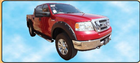
Ford F150 2004-2008