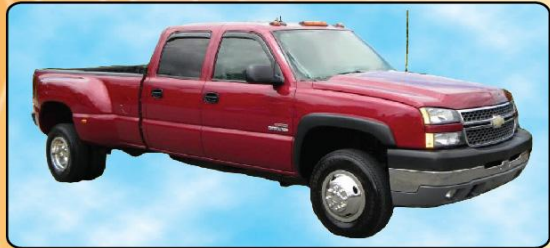
Chevy Silverado Dually 2003-2006 (front only) Chevy Silverado Classic Dually 2007-2007 (front only)