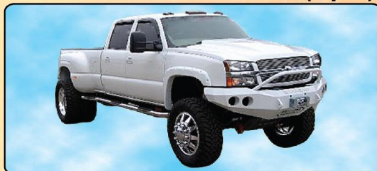
Chevy Silverado Dually 2001-2007 (front only)