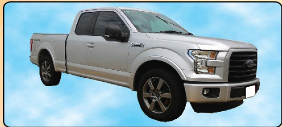
Ford F150 2017 Up