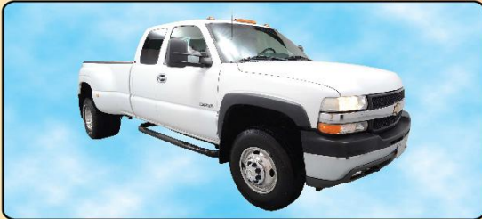
Chevy Silverado Dually 1999-2002 (front only)