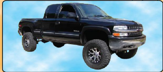
Chevy Silverado Stepside 1999-2006 (front only)