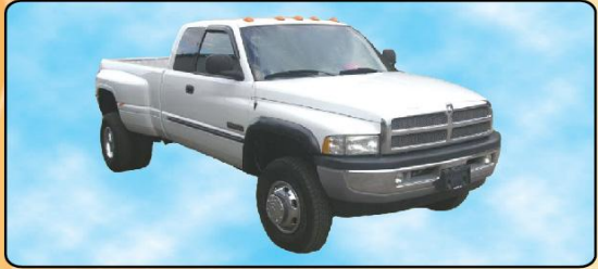
Dodge RAM Dually 1994-2002 (front only)