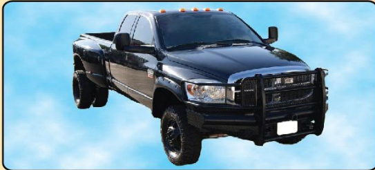
Dodge RAM Dually 2006-2009 (front only)