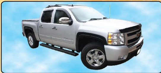
Chevy Silverado 1500 Short Bed (5.8') 2007-2013 (Not fit for Chevrolet Silverado 2500/3500)