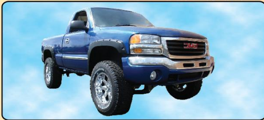
GMC Sierra 1999-2006