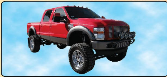
Ford F250 / F350 Super Duty 2008-2010