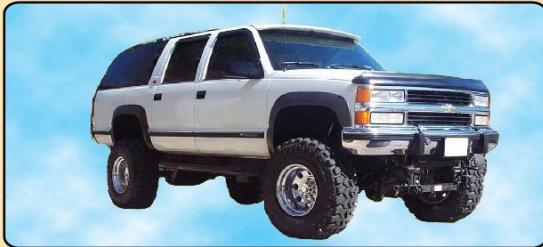
Chevy Suburban 1992-1999