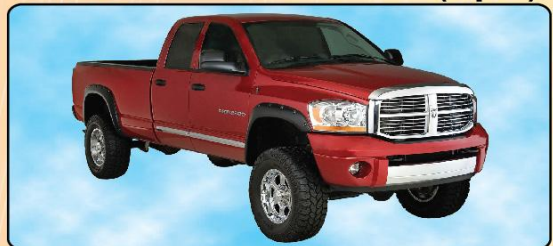
Dodge RAM 2006-2009