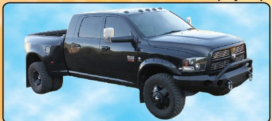
Dodge RAM 2500 / 3500 Dually 2010-2017 (front only)