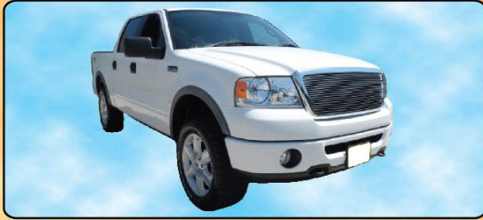
Ford F150 2004-2008