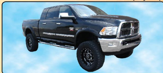
Dodge RAM 2500 / 3500 2010-2017