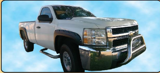
Chevy Silverado 1500/2500/3500 Std & Long Bed (6.5' / 8') 2007-2014