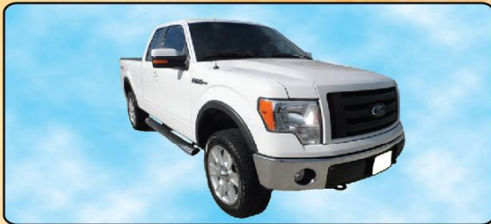
Ford F150 2009-2014