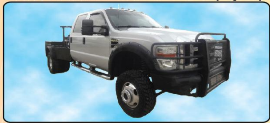
Ford F250 / F350 Super Duty Dually 2008-2010 (front only)