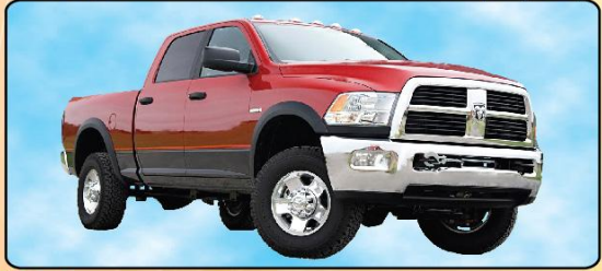
Dodge RAM 2500 / 3500 2010-2017