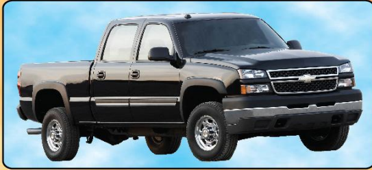
Chevy Silverado 2003-2006 Chevy Silverado Classic 2007-2007