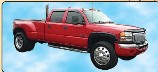
GMC Sierra Dually 1999-2007 (front only)