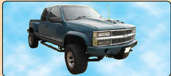
Chevy CK Stepside 1988-1998 (front only)