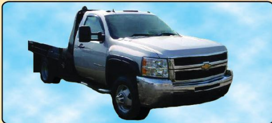
Chevy Silverado Dually 2007-2014 (front only)