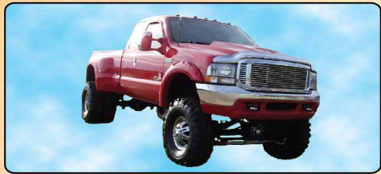
Ford F250 / F350 Super Duty Dually 1999-2007 (front only)