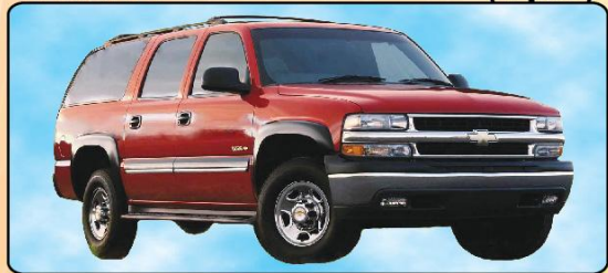
Chevy Suburban 2000-2006