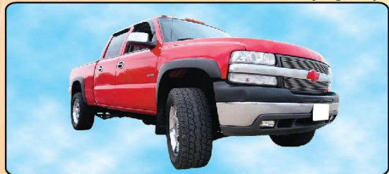
Chevy Silverado 1999-2002