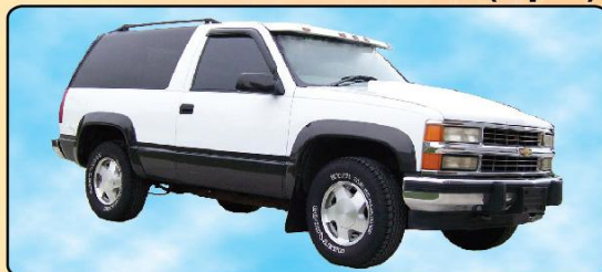
Chevy Tahoe 2dr 1995-1999