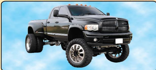
Dodge RAM Dually 2002-2005 (front only)