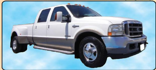
Ford F250 / F350 Super Duty Dually 1999-2007 (front only)