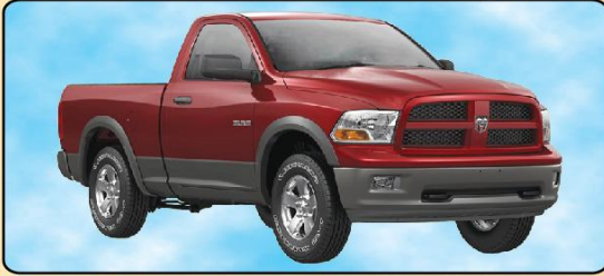
Dodge RAM 1500 2009-2017