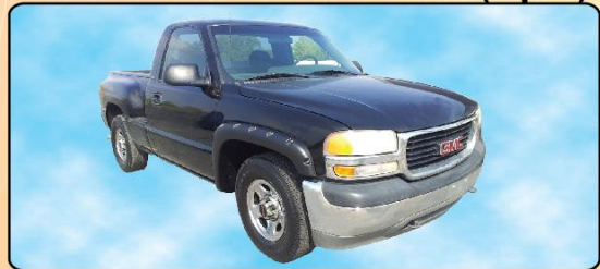
Chevy Silverado Stepside 1999-2006 (front only)