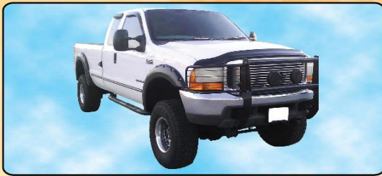
Ford F250 / F350 Super Duty 1999-2007