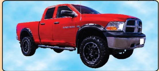
Dodge RAM 1500 2009-2017