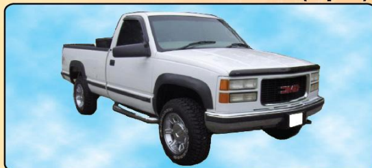
GMC Sierra 1500 1988-1998 GMC Sierra 2500 / 3500 1989-2000