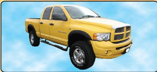
Dodge RAM 2002-2005