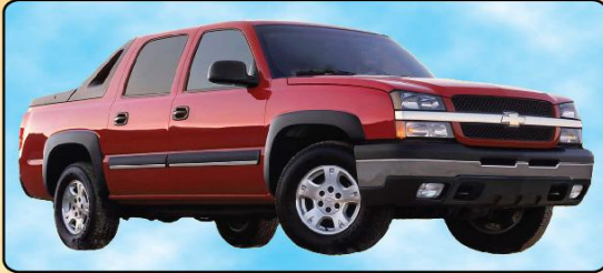
Chevy Avalanche (w/o body cladding) 2002-2006