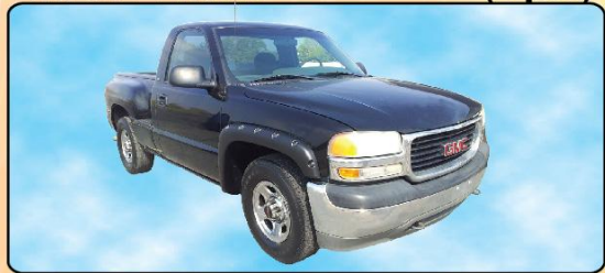
GMC Sierra Stepside 1999-2006 (front only)