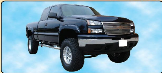
Chevy Silverado 2003-2006