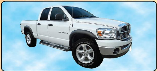
Dodge RAM 1500 2006-2008 Dodge RAM 2500 / 3500 2006-2009