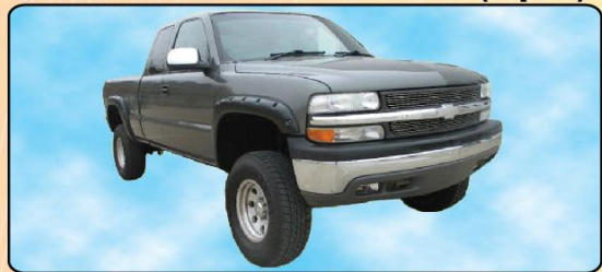
Chevy Silverado 1999-2002