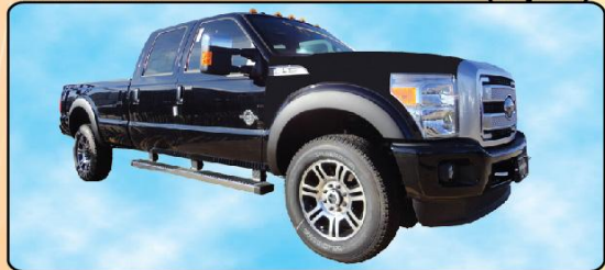
Ford F250 / F350 Super Duty 2011-2016