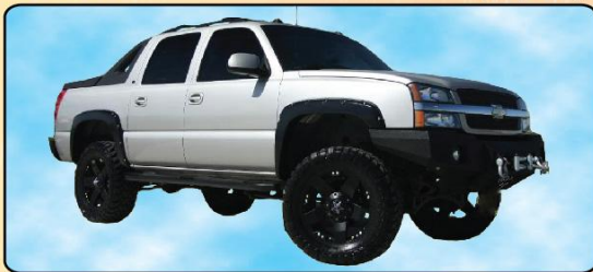
Chevy Avalanche (w/o body cladding) 2002-2006