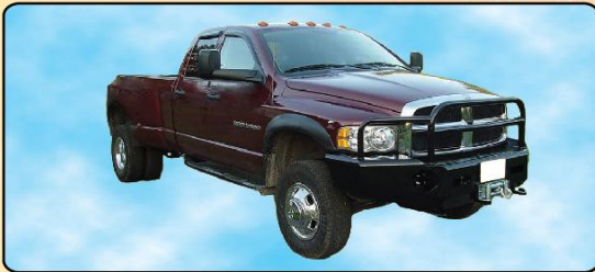
Dodge RAM Dually 2003-2005 (front only)