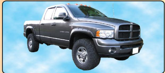
Dodge RAM 2002-2005