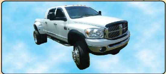
Dodge RAM Dually 2006-2009 (front only)