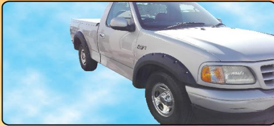
Ford F150 1997-2003