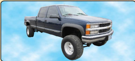
Chevy CK 1500 1988-1998 Chevy CK 2500 / 3500 1988-2000