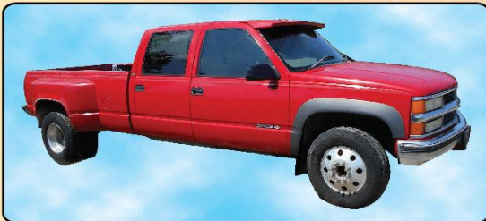
Chevy CK Dually 1988-2000 (front only)