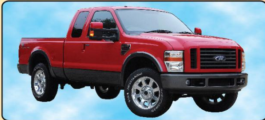
Ford F250 / F350 Super Duty 2008-2010