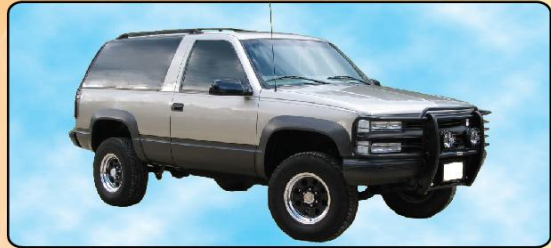
Chevy Blazer 2dr 1992-1994