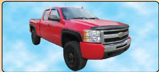
Chevy Silverado 1500 Std & Long Bed (6.5'/8') 2007-2013 Chevy Silverado 2500 / 3500 Std & Long Bed (6.5'/8') 2007-2014