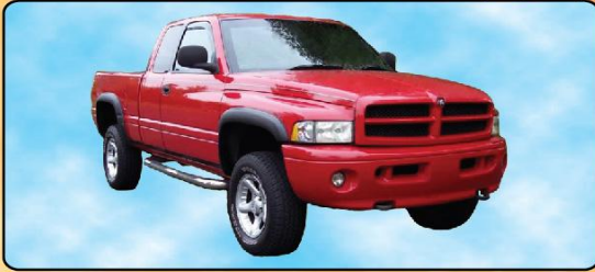
Dodge RAM 1500 1994-2001 Dodge RAM 2500 / 3500 1994-2002