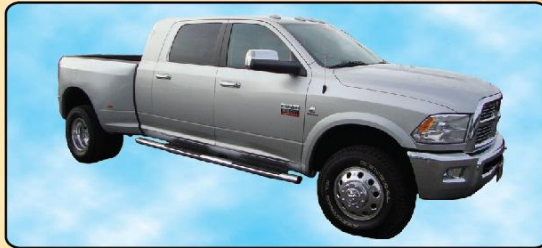
Dodge RAM Dually 2010-2017 (front only)