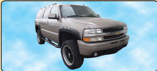
Chevy Suburban 2000-2006