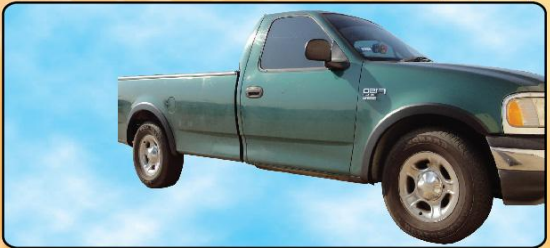
Ford F150 1997-2003