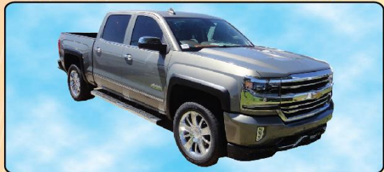
Chevy Silverado 1500/2500/3500 2016 Up