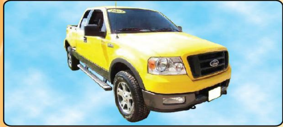
Ford F150 Stepside 2004-2008 (front only)