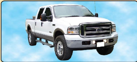
Ford F250 / F350 Super Duty 1999-2007