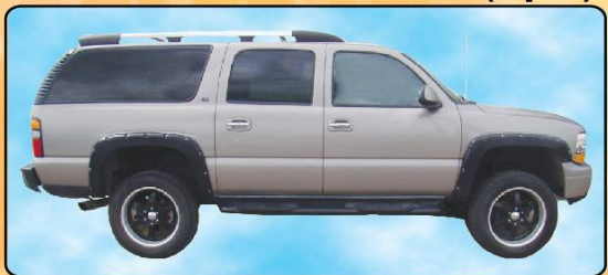
GMC Yukon XL 2000-2006