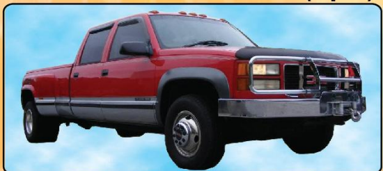
GMC Sierra Dually 1989-2000 (front only)