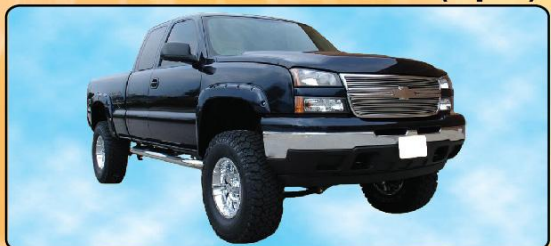
Chevy Silverado Classic 2007-2007