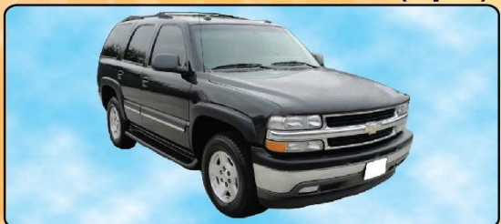
Chevy Tahoe 2000-2006