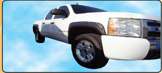
Chevy Silverado 1500 Short Bed (5.8') 2007-2013